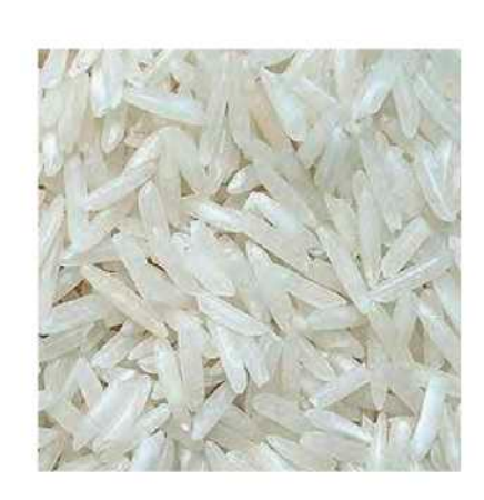
Jasmine Rice 5% Broken