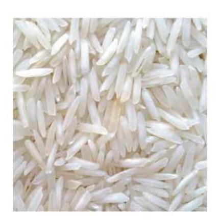
Basmati Rice 5% Broken