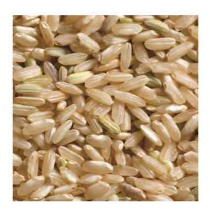
Brown Rice Long Grain 5% Broken