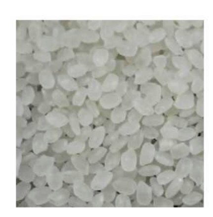
Japonica Rice 5% Broken