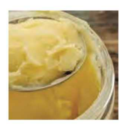
Shortening Vegetable Ghee