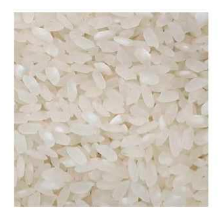
Camolina Rice Medium Grain 5% Broken